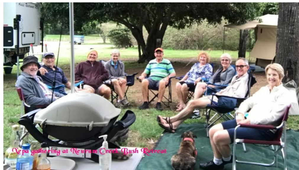
Open gathering at Neerim Creek Bush Retreat